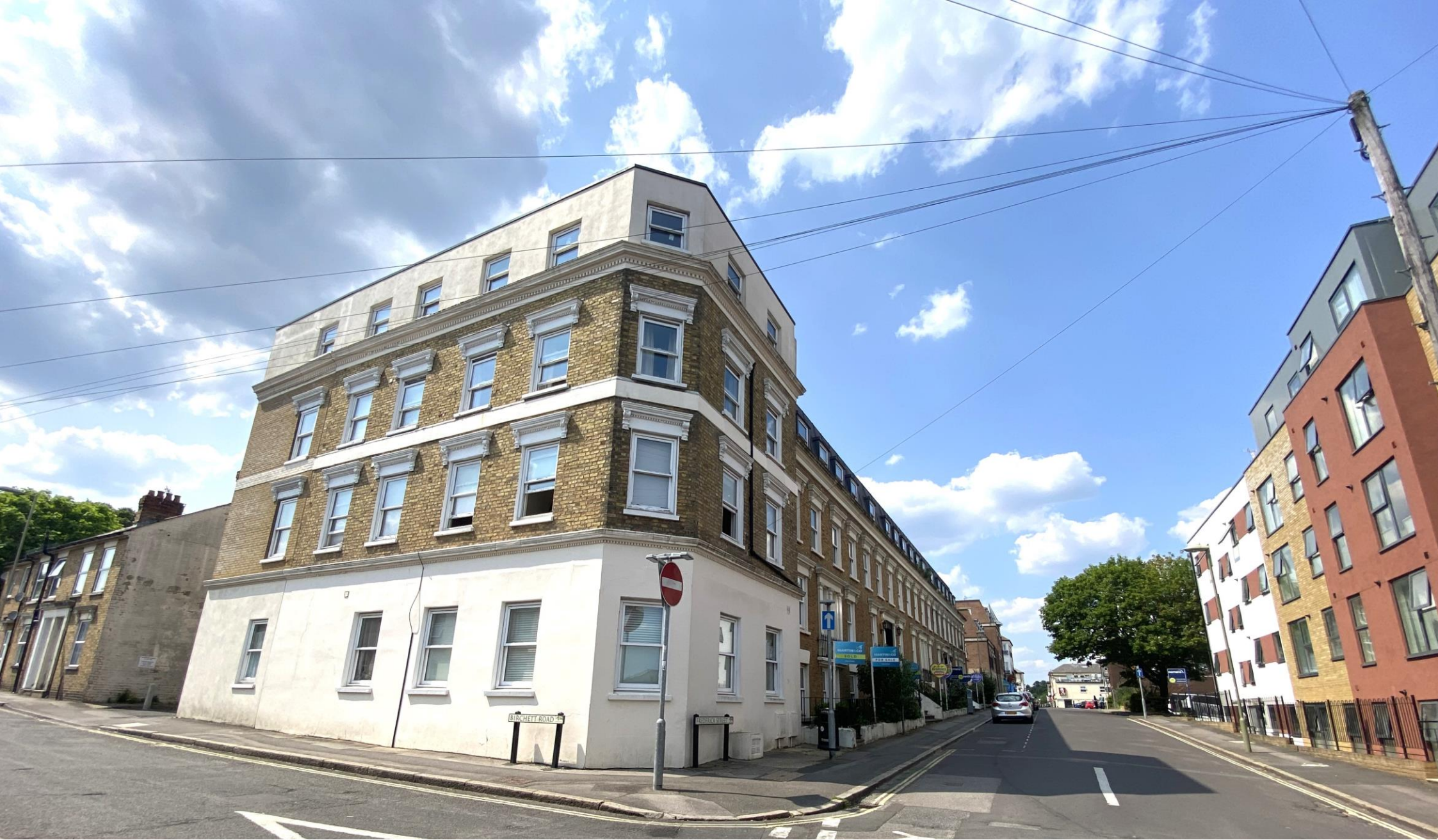
7 Birchett House, Birchett Road, Aldershot